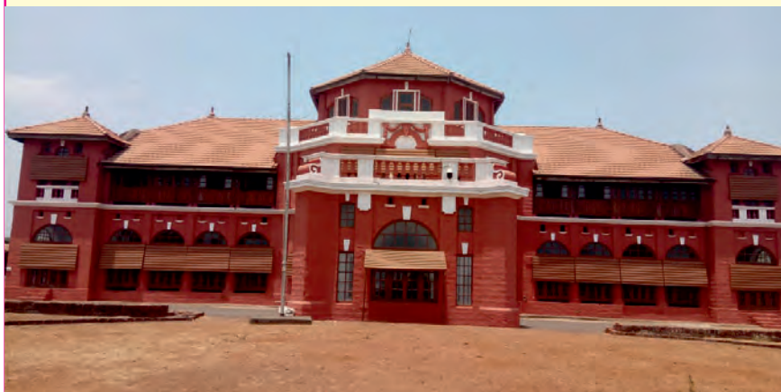
Thibaw Palace, Ratnagiri

Lokmanya Tilak, who was born in Ratnagiri was kept in the jail at Mandalay in Myanmar with a view to keep him away from the Indian Movement of Independence. Tilak wrote 'Geetarahasya' in this prison. Later, Netaji Subhash Chandra Bose was also sent to Mandalay jail.